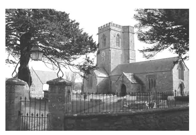
St Mary's Church